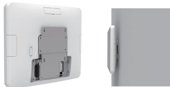
Wall Mount, via VESA mount kit