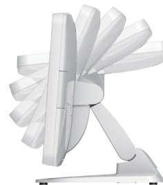
Tilt motion, 0-90 °C Freestyle rotation