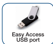
Easy Access to USB Port