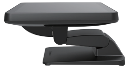
Foldable design with dual hinge