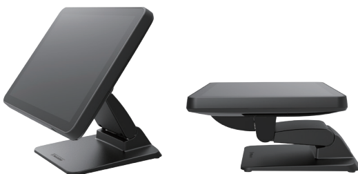
Foldable design with dual hinge