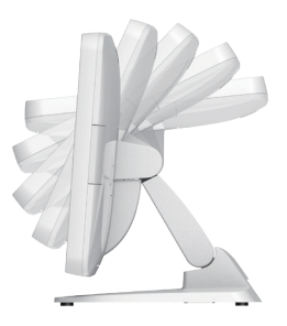
Tilt motion, 0~90 °C Freestyle rotation