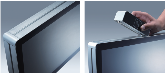
Side groove design for Flexible peripheral device