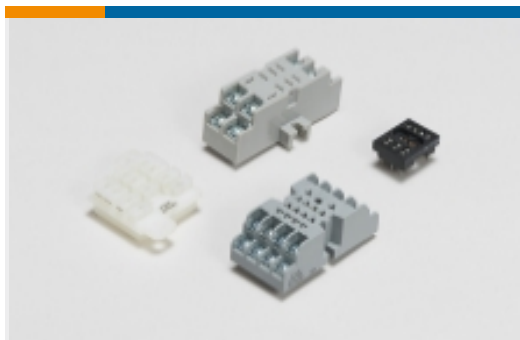
Relay Accessories, Sockets & Clips(9)