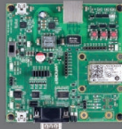
xPico 110 Evaluation Board