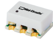
CASE STYLE: TT1224