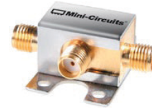
Generic photo used for illustration purposes only CASE STYLE: FL905