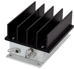
Generic photo used for illustration purposes only