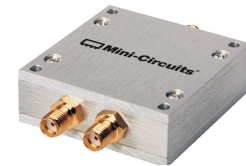
CASE STYLE: VVV845