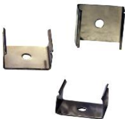
MOUNTING CLIP JKL Part No.: ZRC-17-MC