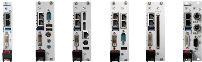
cPCI-3520 cPCI-3520D cPCI-3520G cPCI-3520L cPCI-3520M cPCI-3520T