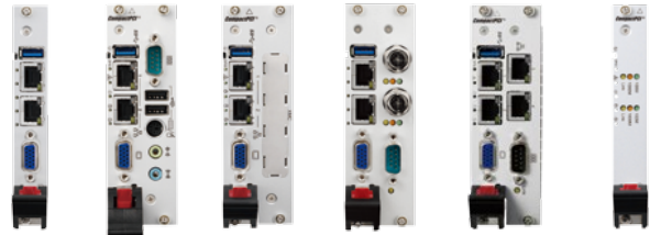
cPCI-3620 cPCI-3620D cPCI-3620S cPCI-3620T cPCI-3620TR cPCI-3620N