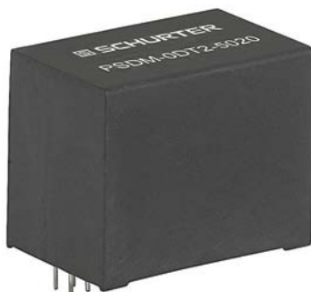
PSDM-6T (Data transfer via optocoupler)