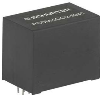
PSDM-60 (Data transfer via transformer)