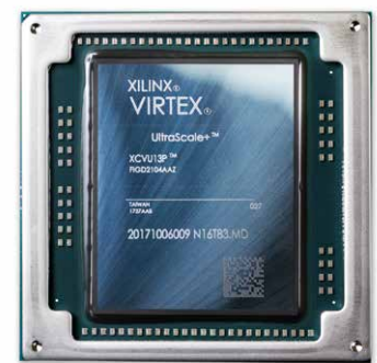
Xilinx VU13P FPGA: lidless package is used by BittWare's Viper thermal management for enhanced cooling performance

BittWare's Viper platform uses advanced computer flow simulation to drive the physical board design in a thermals first approach, including the use of heat pipes, airflow channels, and arranging components to maximize the limited available airflow in a server. The XUP-VV4 features air cooling by default, but liquid cooling is also available. The board features the D2104 lidless package from Xilinx—allowing the heat pipes to contact the die directly, instead of through the heat spreader lid.